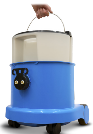
Easy to fill "no spills" tank