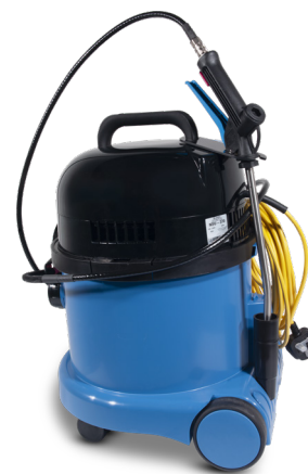
Compact to store

Whilst we recommend using TECcare® Control, the NSU370 is fully compatible with disinfectant solutions based on Quaternary Ammonium Salts or Hypochlorous Acid using appropriate dilution levels. Use of other chemical/disinfectant solutions may invalidate warranty. *